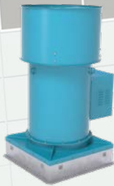
Model QLSH Features: Mixed Flow Fan, Leading Energy Efficiency and Quiet Design Application: Smoke and Heat Ventilation

Twin City Fan & Blower offers the most comprehensive line of fans in the air movement industry. Our team designs, tests and manufactures fans for all types of commercial buildings. We are able to meet your most precise requirements to provide your entire facility with HVAC equipment. Due to Twin City Fan's long-standing reputation and proven quality, we have expanded manufacturing and service capabilities to Europe, India, China, Singapore and the Middle East.