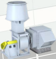
Model BAIFE Features: Induced Flow Centrifugal Fan and Modular Mixing Box Application: Laboratory and Fume Exhaust