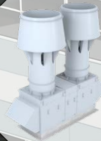
Model TVIFE Features: Induced Flow Mixed Flow Fan, Mixing Plenum Box, Innovative Turbo-Vane™ Design Application: Laboratory and Fume Exhaust