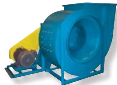
Model BCS Backward Curved High Volume/Pressure Fan