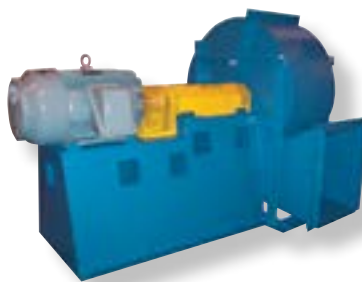
Model HIB High Efficiency Industrial Backward Curved Fan