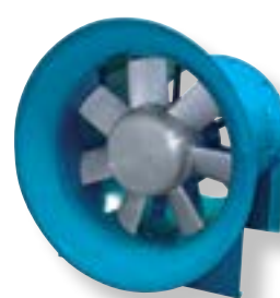
Model TCVX Adjustable Blade Vaneaxial Fan

Every fan that we manufacture for the nuclear market undergoes a rigorous testing and validation process to meet the industry requirements for vibration, air and sound performance. In addition, Twin City Fan & Blower tests all fans for structural and mechanical integrity. Our capabilities allow us to perform our testing in our AMCA 210 certified laboratory as well as our nuclear fan manufacturing facility.