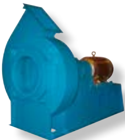
Model RBA Industrial Radial Bladed Fan

Our in-house Nuclear Quality Assurance Program ensures that all of our products and components are compliant with industry regulations. We pay special attention to the implementation and verification of our procedures to fully support the nuclear application requirements. This process allows us to record and verify each step of the manufacturing process and provide our customers with the highest quality products.