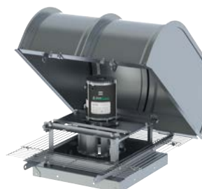
DCLH | DCLP