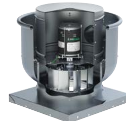
DCRU | DCRUR DCRW | DCRWR