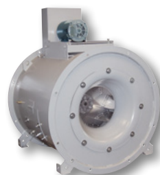
Model TCLB Inline Centrifugal Fans

While a number of different fans were used in the Lucas Oil Stadium project, 72 TCLB Inline Centrifugal Fans were used for a variety of general exhaust applications – the largest was 27 inches (size 270) with 11,000-12,000 CFM and a 10 HP motor. In many instances, the fans were installed in tight areas, including the lay-in ceiling directly above seating areas and in the areas servicing the suites. Because of their proximity to the public, it was important that the fans operate quietly.