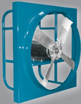
Model TCWPX Propeller Wall Fans