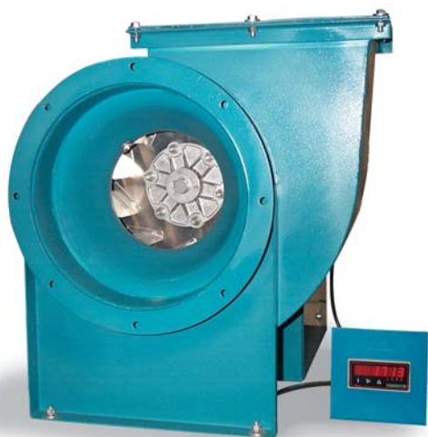
A. Fan operating with unobstructed inlet produces 1713 CFM

Shown below is a Twin City Fan model 165 BCV fitted with a Piezometer Ring Airflow Measuring System, operating at 1100 RPM. With an unobstructed inlet, the digital display indicates the fan is producing 1713 CFM, which closely matches rated performance (see photo A). After placing an obstruction in the inlet, the airflow is reduced to 1597 CFM (see photo B).