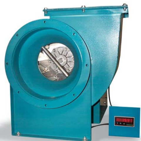
B. Fan operating with obstructed inlet produces 1597 CFM